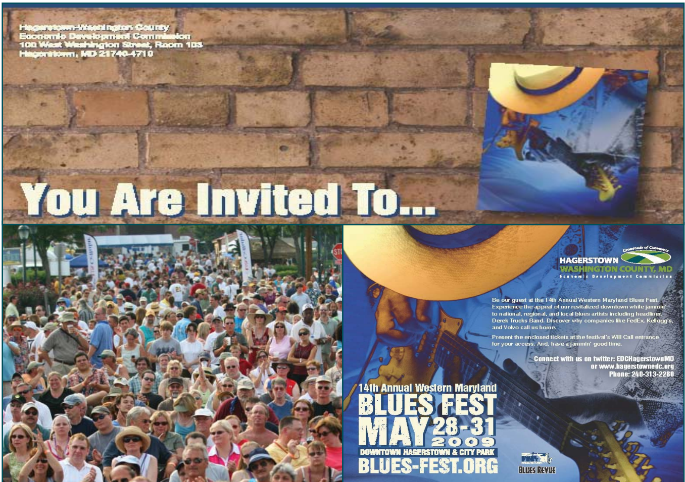
2009 EDC Blues Fest Invitation sent to close to 1,000 people nationwide.

The mailer has produced limited attendance in years past due to contributing factors such as inclement weather. The most successful year thus far was Blues Fest 2009 where over 40 participants came from businesses in the Baltimore / Washington DC metro areas - over 50% more than in prior years. Brokers attended from well-known companies such as KLBN, Merritt Properties, NAI Michaels, and Shapiro Company. Employees of biotech companies such as MedImmune and the National Institutes of Health (NIH) also participated. The EDC has used this opportunity to follow up with attendees and open up discussions regarding Washington County.