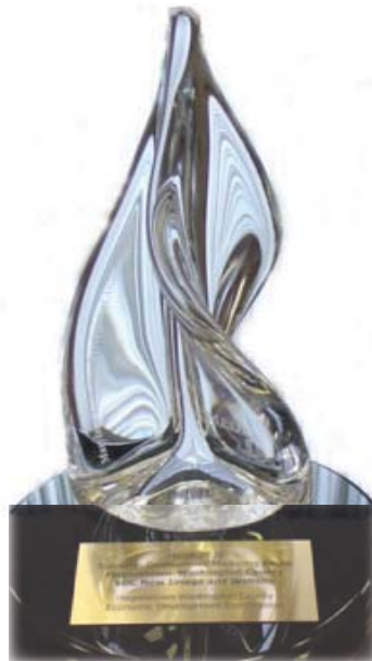
2009 MEDA Economic Development Marketing Award

The Economic Development Marketing Award category had 13 other highly